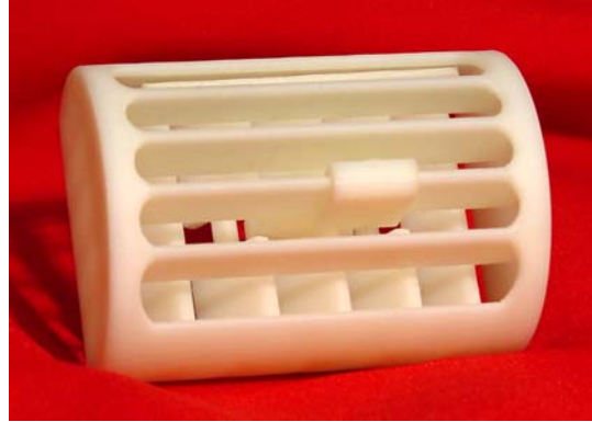
The air vent, constructed as a one-piece assembly, illustrates rapid manufacturing's ability to consolidate parts.

Eliminating DFM constraints also take DFA to new levels. No longer limited by the process, direct digital manufacturing allows complete assemblies, both static and dynamic, to be constructed as a single part. This degree of part consolidation eliminates assembly time, expense and errors while drastically reducing manufacturing costs and inventory part counts. For instance, an automobile air vent is assembled from many components, including the main housing, louvers and flow control mechanism. With direct digital manufacturing, the entire assembly can be produced as one piece, which eliminates all cost, time and quality problems that result from an assembly operation.